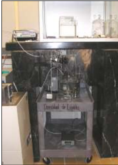
Fig. 2. Hydrostatic weighing system of CENAM. Thermostatic bath implemented by CENAM for this bilateral comparison.

In order to keep constant the temperature, INMETRO used a commercial bath Tamson TMVA 70, see fig. 3.