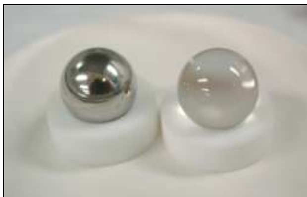
Fig. 1. Travelling standards for this bilateral comparison

The measurand for this bilateral comparison were the volume at 20°C of both spheres. The isothermal compressibility of the spheres was considered negligible for this comparison.