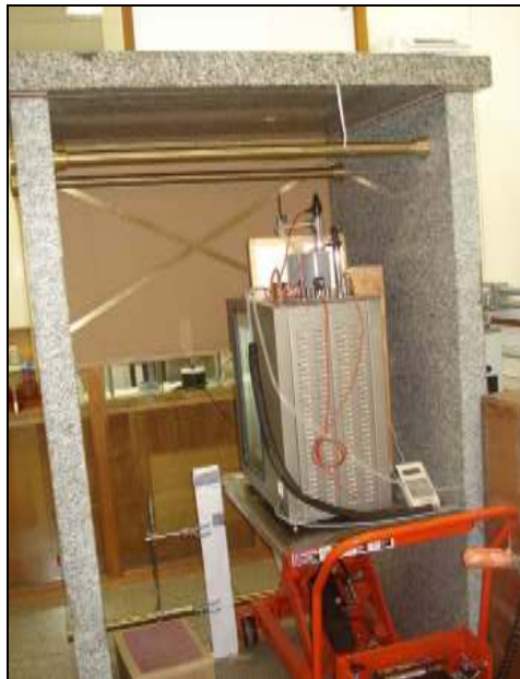
Fig. 3. Hydrostatic weighing system of INMETRO. The balance is placed in the upper part of the tall table. The thermostatic bath is in the middle of the picture.