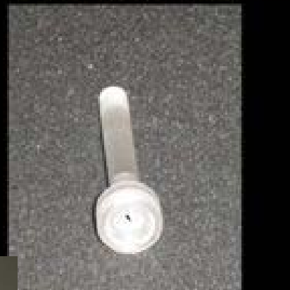
^{94}\text{Nb}/^{93}\text{Nb}^m reference source