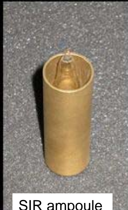
SIR ampoule in brass liner