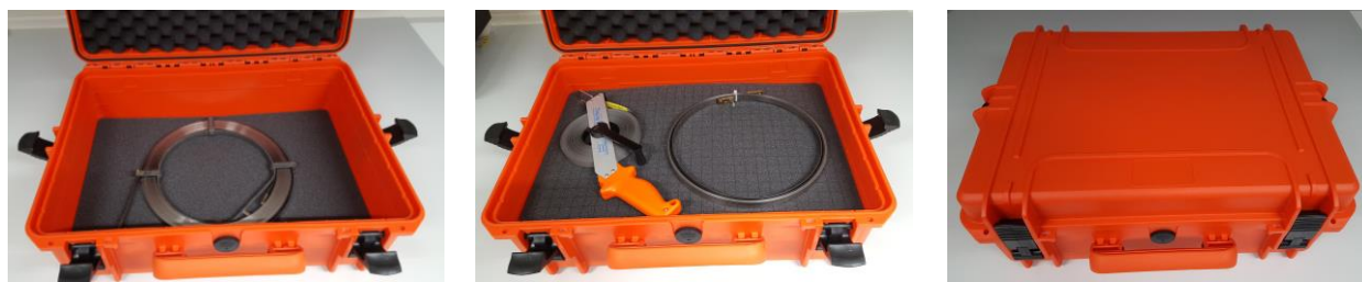
Figure 1 – Transporting case ( the oil vial will be added )

The steel tapes need to be protected against corrosion when not being measured by means of protective oil. The pilot laboratory will include a vial with appropriate oil in the transportation case. Please cover them with this product before packing them for transportation or when stocked for more than three days. The steel tapes shall be transported rolled up and may not be kinked during handling. Each participating laboratory shall cover the costs of shipping and transport insurance against loss or damage. The package should be shipped with a reliable parcel service of its choice.