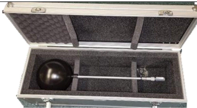
Figure 1. Transfer chamber type PTW 32002