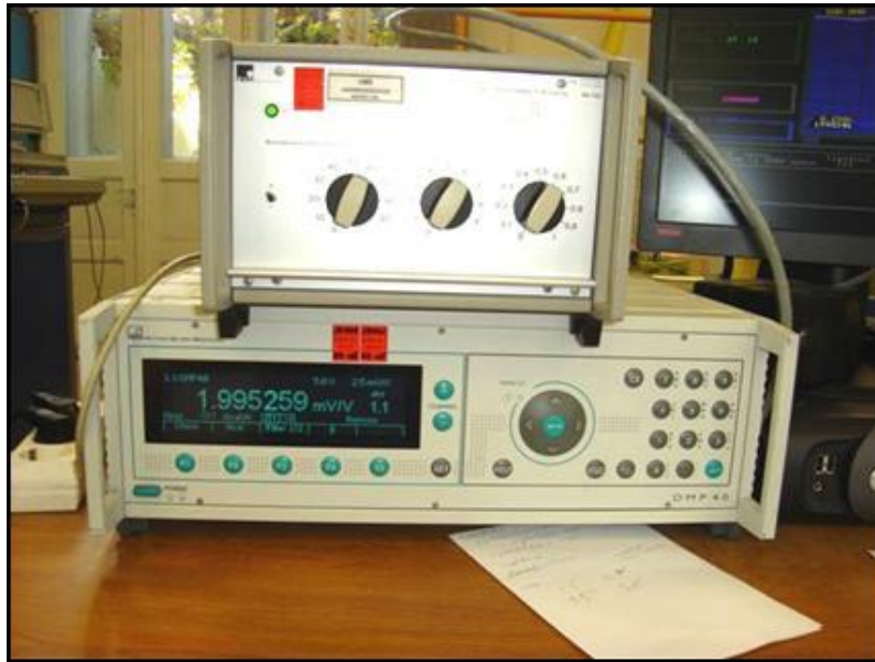
Figure 1. Precision indicating instrument (DMP 40) and BN 100 calibrator of TÜBİTAK UME

DMP 40 or DMP 41 is adjusted as absolute value (ABS), 0.1 Hz Bessel filter, 5 V excitation voltage, the six-wire technique, 0,000001 mV/V resolution, self-calibrating “on” mode and \pm 2.5 mV/V measuring range values during measurements.