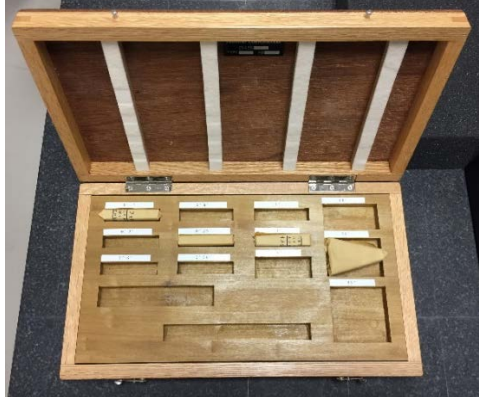
Figure 1 – Transporting case

No re-lapping or re-furbishing of the artifacts should be attempted.