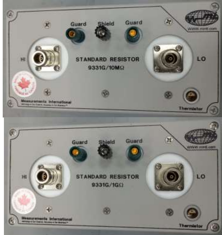
Figure 1. The travelling standards

The standards are manufactured by Measurements International (CA), Model 9331G. The model 9331G is based on a NIST design which includes a split guard design and internal temperature sensor. The split guard circuit design allows for applying independent guard voltages at each side of the resistor. Connections are type N. The Model 9331G is hermetically sealed in a shielded enclosure and isolated from the case.