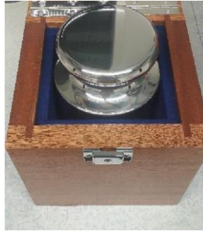
Picture 1. The mass standard inside the box

The travelling standard for this comparison was a 20 kg weight (stainless steel, OIML-form). The travelling standard and transportation box are presented in Picture 1.