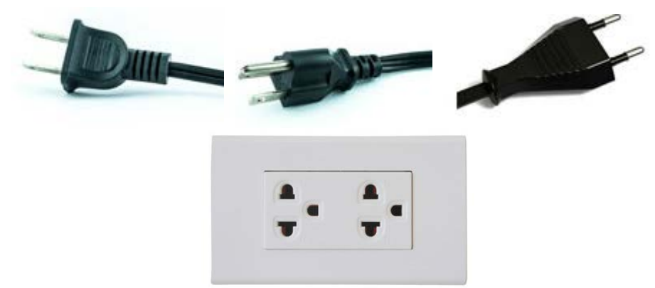
Plug and socket of Type A, B and C

Voltage of power supply is 220 volts AC with 50 Hz. The power plugs used in Thailand are A, B and C.