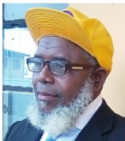
AB OKESINA African Federation of Clinical Chemistry ( AFCC )