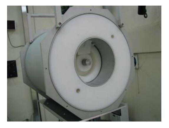
Figure 2 Long counter constructed by KRISS

We designed and produced Long counter for neutron fluence measurement. Also, we calculated its response function and effective center. The calibration measurement for efficiency and the effective center will be performed in this year. Also, we have plans to monitor the stability and the reproducibility.