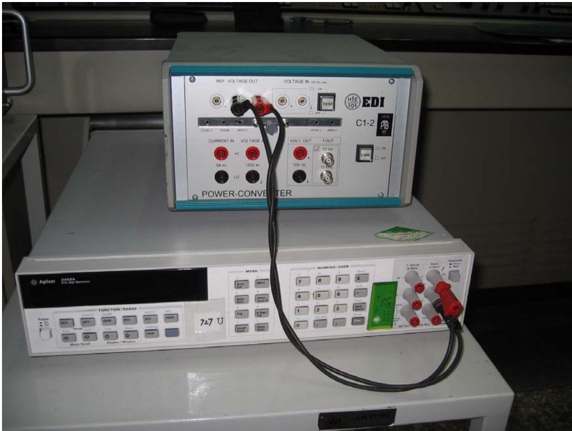
Positive output connection of the traveling standard is shown in the Figure 4.