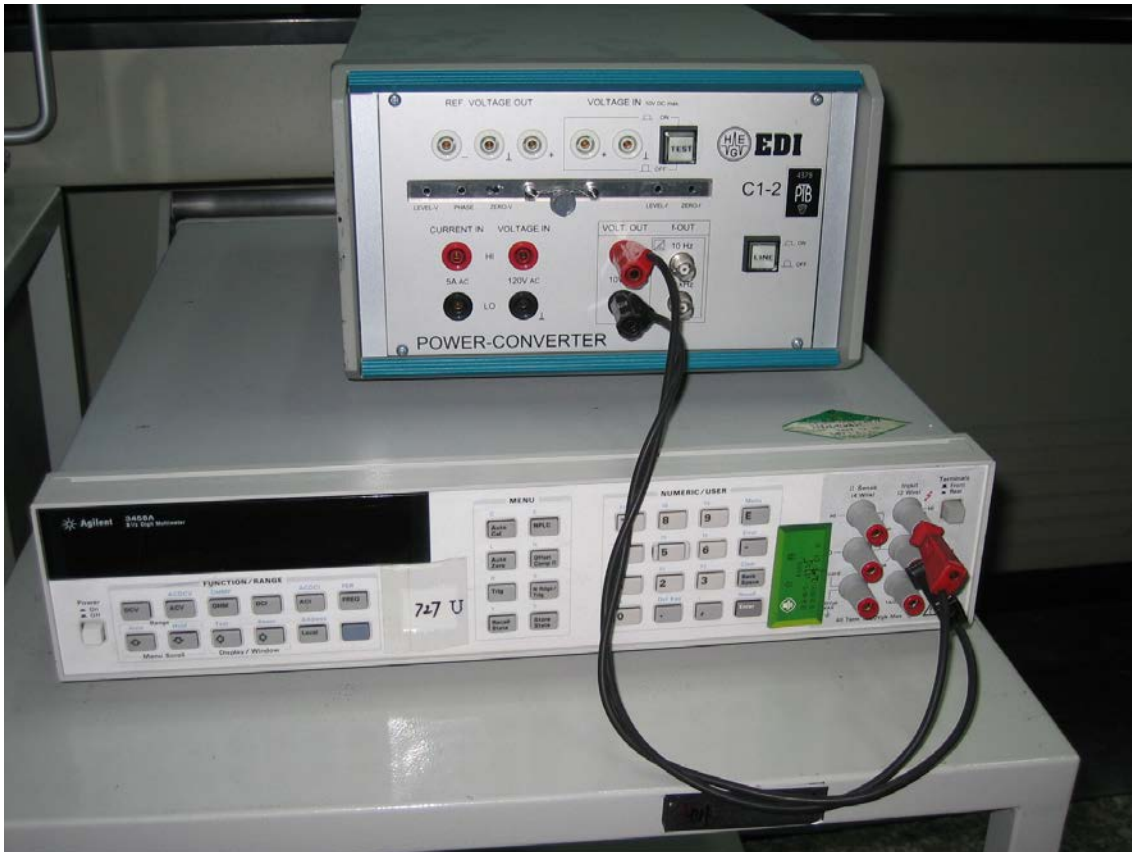
Figure 3. Measurement of the voltage output (VOLT. OUT) of the traveling standard.

A digital multimeter with a high input impedance shall be used to measure the DC voltage. An Agilent (HP) 3458A digital multimeter is shown in the Figure 3 as an example for the measurement of DC voltage values from the traveling standard. Voltage and current input connections are not shown in the figure.