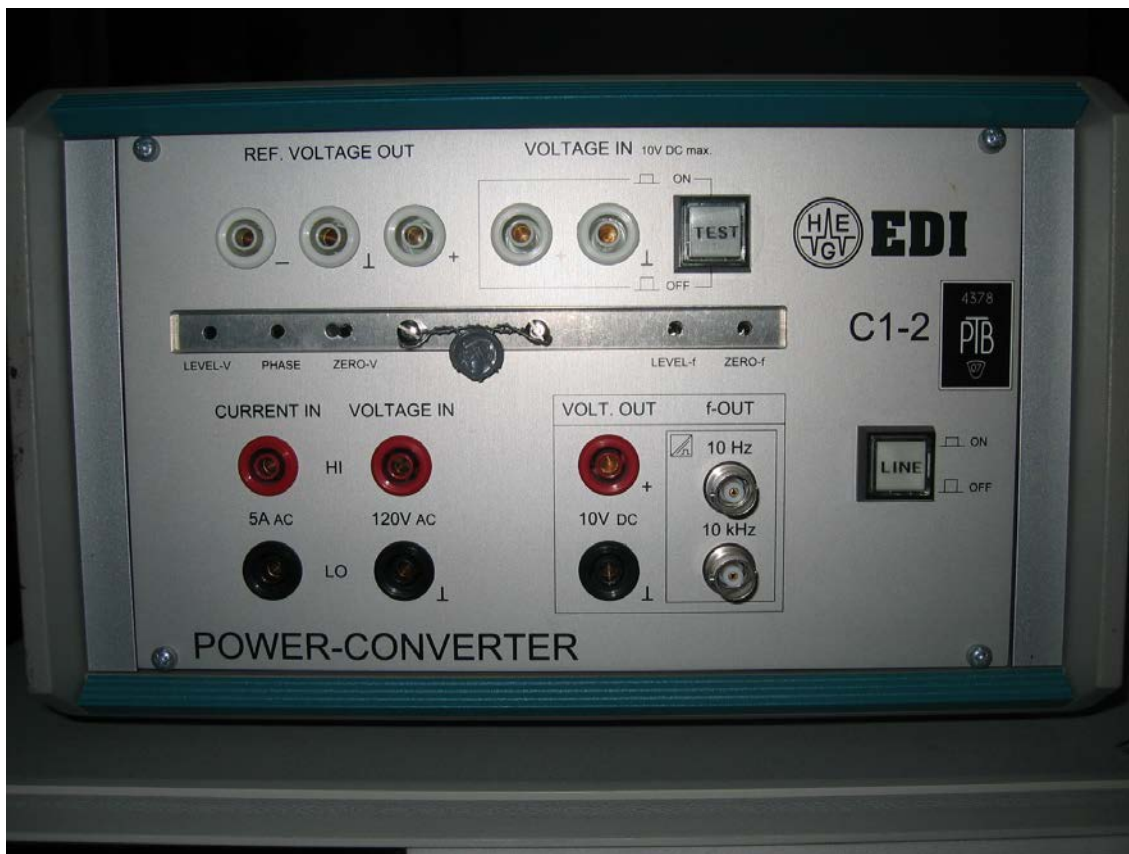
Figure 1. Front panel of the traveling standard C1-2.