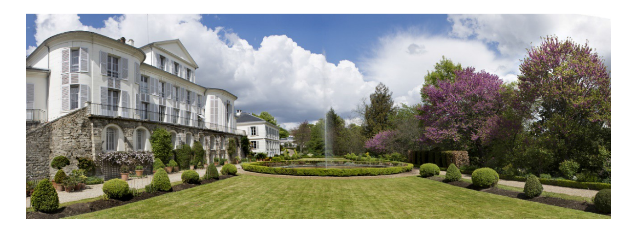
the intergovernmental organization through which Member States act together on matters related to measurement science and measurement standards.

If the secondment opportunity is no longer available or the project is not suitable, the BIPM would be pleased to discuss opportunities for a secondment in the future.