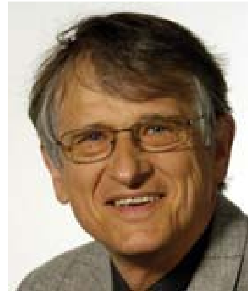
Klaus von Klitzing