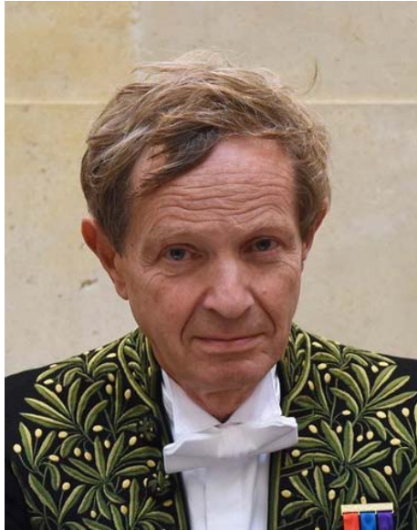
Sébastien Candel président de l'Académie des sciences