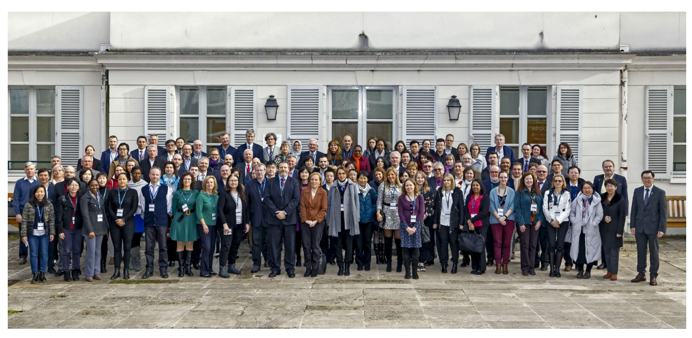
A total of 120 delegates from 28 countries attended the biennial meeting of the JCTLM

www.bipm.org/en/committees/jc/jctlm/workshop-2019.html.