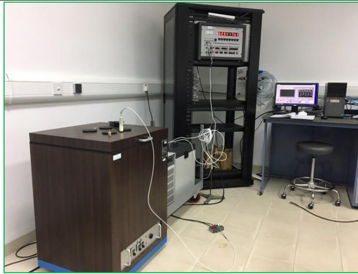
Figure 1. Measuring System of Primary Contact Thermometry

90 is compared against the world's leading National Metrology Institutes (NMIs), establishing global equivalence for Saudi Arabian standards.