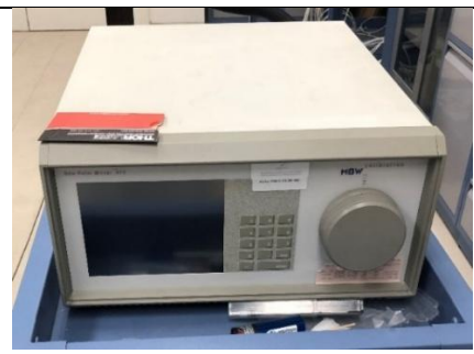
Figure 5. Dew point Meter