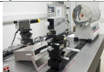
Figure 6. IR System