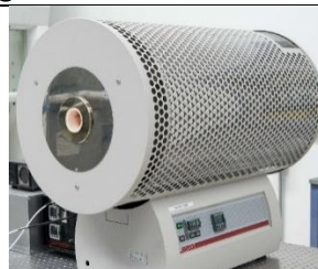
Figure 7. Fixed point Furnace