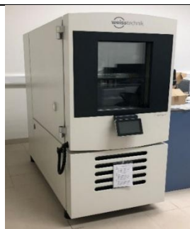
Figure 3. Humidity Chamber