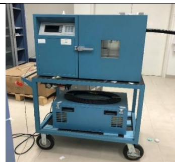
Figure 4. Two P Generator