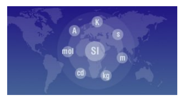
18th meeting of the CCTF