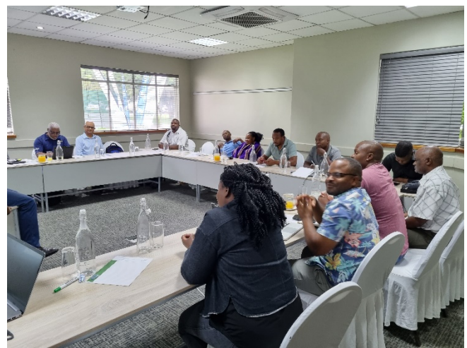
At SIRDC-NMI, Harare, Zimbabwe Jan 2023, SADCMET Mass ILC workshop

At MBS, Blantyre, Malawi April 2023, Volume Metrology